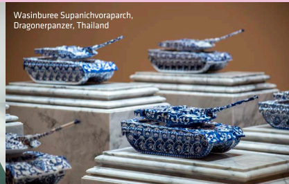
Wasinburee Supanichvorapach, Dragonerpanzer, Thailand