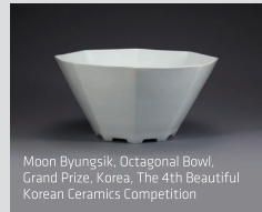
Moon Byungsik, Octagonal Bowl, Grand Prize, Korea, The 4th Beautiful Korean Ceramics Competition

Period September 6 Fri - October 20 Sun, 2024